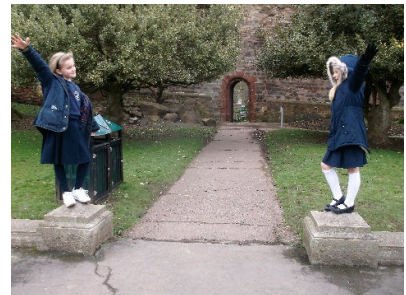
Yesterday Class 2 enjoyed an informative trip to Exeter to find

out more about the Romans. They were given a tour of the Roman sites by a Redcoat Guide and then had time to explore more at the museum.